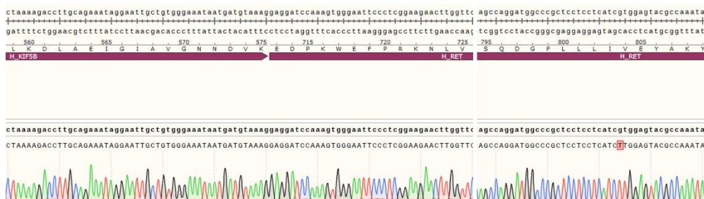
Figure 2 | The KIF5B-RET mutation analysis by Sanger sequencing.